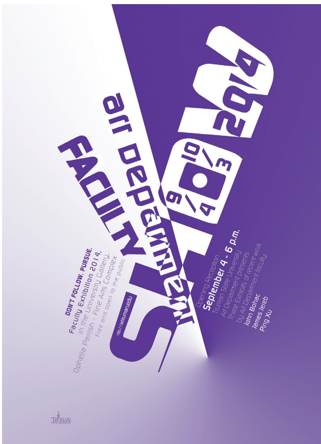
"Faculty Show Poster -2014" 16" X 22", Adobe Photoshop CC & Illustrator CC, 2014